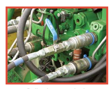
Ball valve wing lock up system