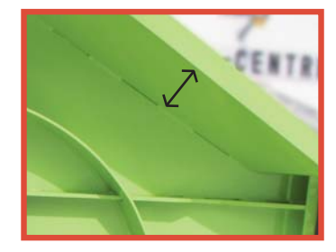
13 5/8" frame depth for maximum material flow