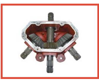
260hp heavy duty splitter box with 1 3/4" splined shafts