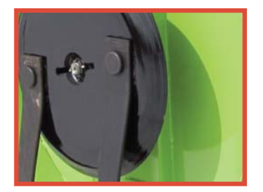
7 gauge spun formed stump jumper pans