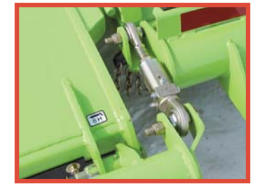
Greasable adjustable turn buckles for parallel levelling