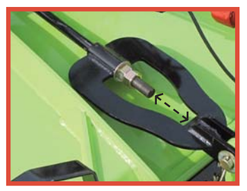
Single levelling rod with floating hitch