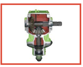
210hp Right Angle Gearboxes Heavy duty 1 3/4" input shafts. 2 3/8" tapered & splined down shafts