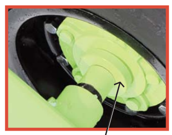
Metal seal guards on 517 hubs