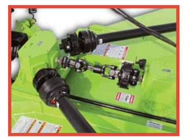
Heavy duty drive system for peak performance