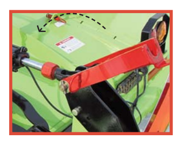
Single center lock up system